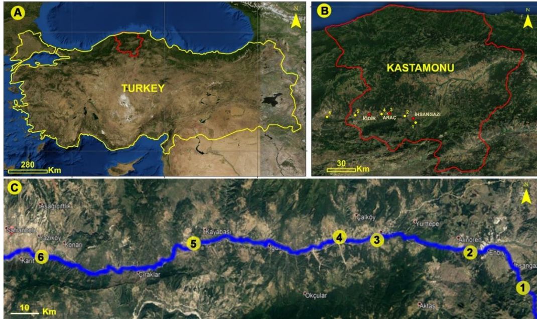
Fig. 1. (A) Map of Turkey. (B) The general view of study area. (C) Sampling stations in Araç Creek (Google Earth 2019). The numbers denote the stations whose details are given in Table 1.

affected by various human activities including city sewage systems, organic wastes, agricultural activities, hydroelectric power plants and sand quarries. Macroinvertebrate samplings were performed at 6 stations along the creek in April, August and October 2013 (Fig. 1). The coordinates and altitudes of the sampling stations as well as sampling dates and short descriptions of the localities where the stations were selected are given in Table 1.