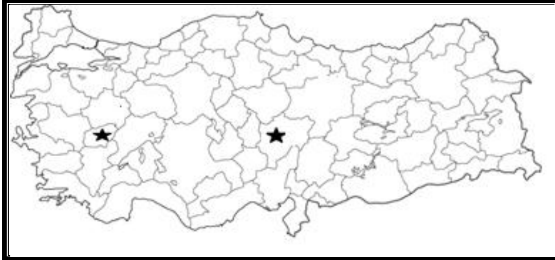
Fig. 1. Collecting localities, of Marjanus platnicki (Zhang, Song & Zhu, 2001), from Uşak Province and Erciyes Mountain, Kayseri Province.

In this study, both female specimens were collected from Uşak Province and Kayseri Province (Erciyes Mountain) in Anatolia. Examined specimens were preserved in 70% ethanol and deposited in the NOHUAM. In the identification, Chatzaki (2018) was consulted. The identification was made by means of a SZX61 Olympus stereomicroscope.