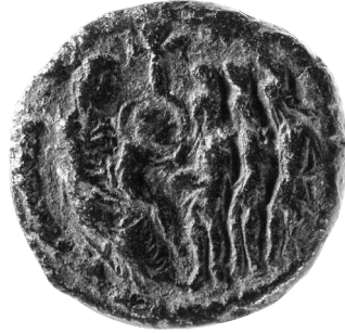
Fig. 3 Terracotta pilgrim's token ( http://www.britishmuseum.org/research/collection_online/collection_object_details.aspx?objectId=62931&partId=1 , Access date: 30.12.2013).