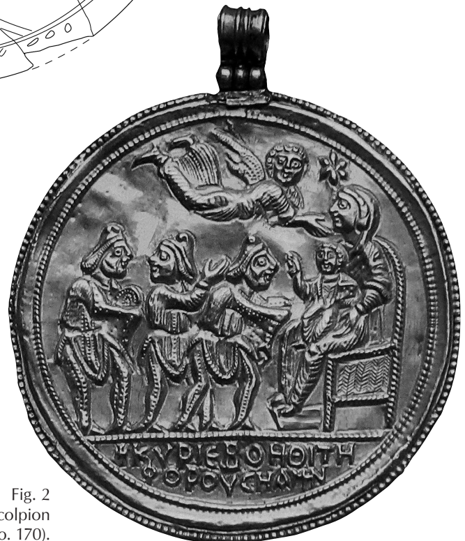
Fig. 2 Gold encolpion (Entwistle 1990, cat. no. 170).