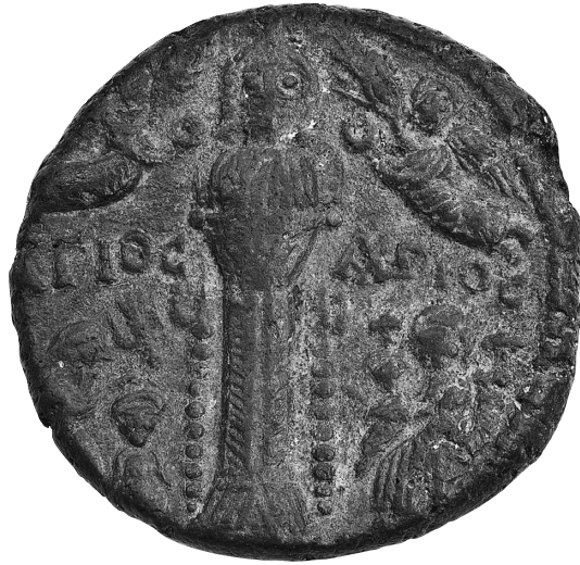
Fig. 4 Terracotta pilgrim's token ( http://www.metmuseum.org/exhibitions/view?exhibitionId=%7b60853040-AE7E-4162-8FA7-525505D6B633%7d&oid=477460&pg=1&rpp=100&pos=73&ft=* , Access date: 30.12.2013)