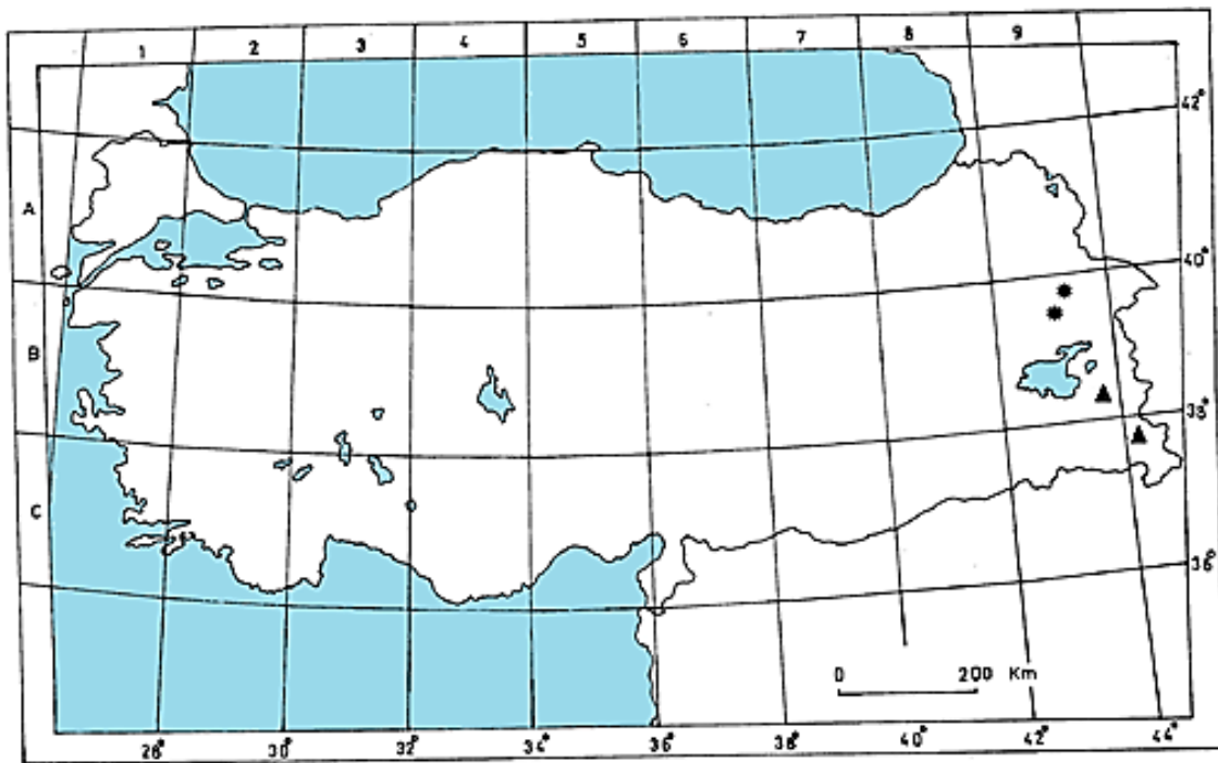
Figure 2. Distribution area of Marrubium vulcanicum (●), and Marrubium vanense (▲).