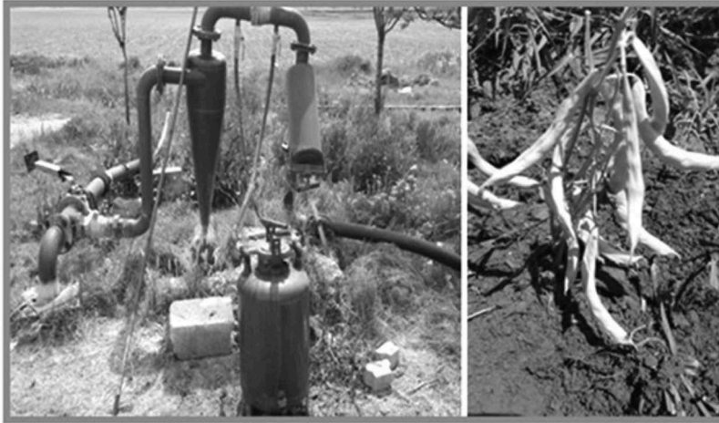
Figure 2. The harvest of the dry bean and irrigation treatments.