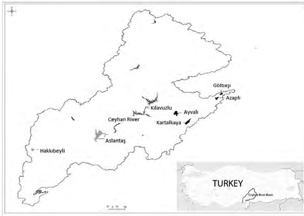
Fig. 1. Location of the Ceyhan River basin and the lakes under study.

Oligochaetes and other macroinvertebrates were separated from substrate materials in samples using a 500 \mu\text{m} sieve, and using thin long-nosed tweezers; sieved specimens were then fixed in 4% formalin. The samples brought to the laboratory were divided into groups and then preserved in 70% ethyl alcohol (Welch 1948). Samples were sorted, identified and enumerated in the laboratory using both dissecting and compound microscopes. With the exception of immature and damaged/incomplete specimens, all oligochaetes sorted from benthic samples were identified to the lowest possible taxonomic level, usually to genus or species. Oligochaete specimens were identified using the keys and diagnoses presented in the following publications: Brinkhurst (1971a, b), Kathman & Brinkhurst (1998), Timm (1999) and Pinder (2010). Classification and nomenclature follow that presented in the above references, and also in Erséus et al. (2008) and Reynolds & Wetzel (2015).