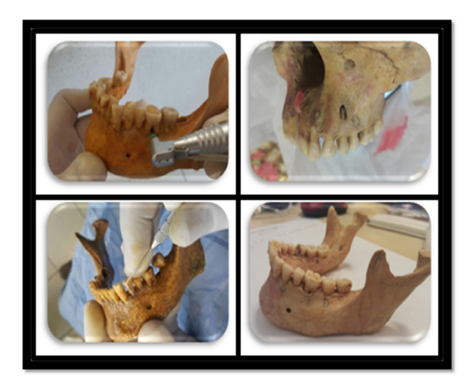
Fig. 1 The photographs of the maxilla and mandible that showing natural defect and simulated defects created with burr and chemical agent.

After preparing all jaws, radiology researchers (MM, MI) acquired intraoral radiographs using a Sorodex Digora Optime UV (Sorodex Medical Systems, Helsinki, Finland) and Planmeca Dixi 3 CCD (Helsinki, Finland). Periapical radiographs were obtained with a parallel technique by using a film holder apparatus to provide standardization. Phosphor plate system operating at 60 and 70 kVp with three different exposure time (0.16, 0.20 and 0.25 sec) and the CCD system operating at 60