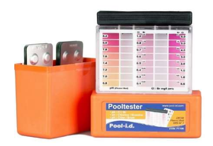
Figure 2. Pool water test kits