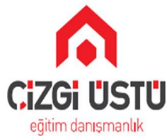
ÇİZGİ ÜSTÜ EDUCATION SUPERVISING