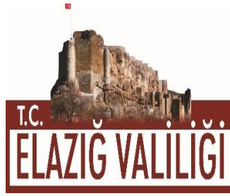
REPUBLIC OF TURKEY ELAZIĞ GOVERNORATE