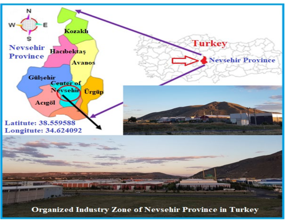
Figure 1: The Location of Research Area

Within the scope of the study, Fine - Kinney method was used for risk assessment in Nevşehir organized industrial enterprises. While calculating the risk value in this method;