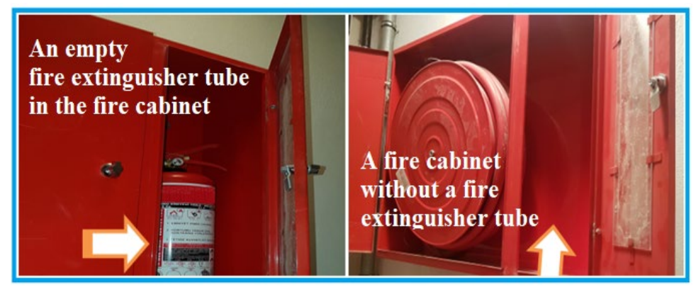
Figure 3: Fire extinguisher tube controls

As a result of the evaluation made in machining companies, the critical risk factor was determined in 7 different applications. Chemical smell breathing risks have been observed in these enterprises. It has been observed that the risk of burning in the limbs of the employees as a result of chemical spills in the enterprises, insufficiency of fire tubes, ergonomic risk in the waist as a result of heavy transportation, and its condition is at a critical level. In figure 3, there is an image regarding the controls made regarding the fire extinguisher tube.