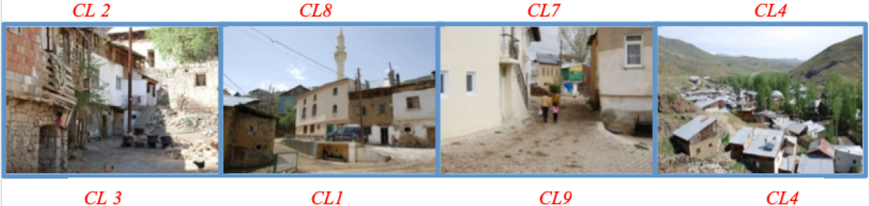
Figure 8. The images with lowest score of landscape beauty