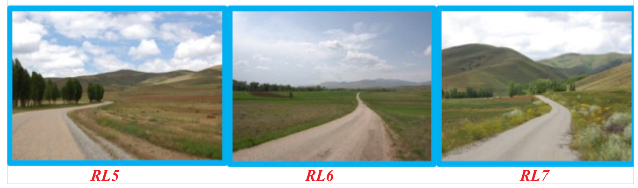
Figure 4. Examples of the road landsape images used in visual quality analysis