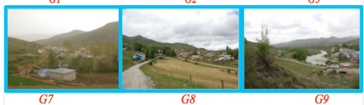
Figure 2. Examples of the general silhouette images used in visual quality analysis