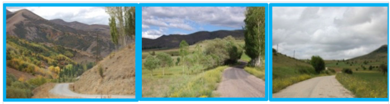
Figure 3. Examples of the vegetation images used in visual quality analysis