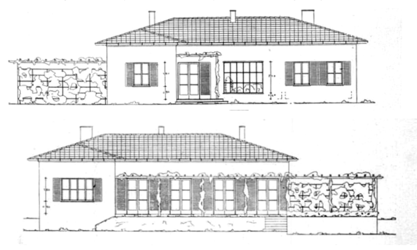
Figure 7: A House Project in Etlik in Ankara (URL-5)

Münevver Belen and Leman Tomsu designed a house in Etlik in Ankara. As narrated by Münevver Belen and Leman Tomsu: The field was inclined towards Ankara and towards the scenery. The building consisted of a ground floor and a basement. The entrance was located in the alley side. There was a toilet and office in one side of the entrance, and there was the door of the anteroom. Transition is made from the anteroom to the study, living room and dining room, and to the bedroom. These rooms are located on the side of the scenery. There is a terrace paved with natural stones and a pergola in