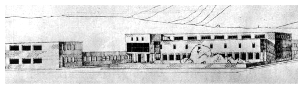
Figure 6: Kayseri Community Hall Building Project (URL-4)

According to the news in Arkitekt Journal that introduced Münevver Belen and Leman Tomsu in 1937 (URL-4), Kayseri Community Hall Building Project had three different entrances. The purpose was to make a differentiation between the users. The building consisted of three different sections; some of these were one-storey and some other were two-storey. In this building, there was a hall that was suitable for balls, a lounge that facilitates the relaxing of people at intervals, a classroom and a library, which were allocated to serve the society, in the second floor.