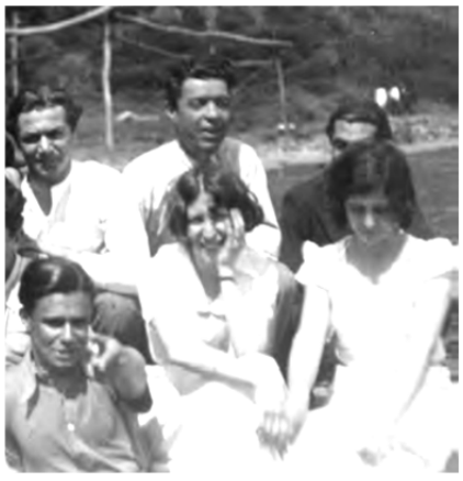
Figure 3: In Yalova Technical Trip (From Bercis Levend Family Archives, Narrated by: Dostoğlu and Erkarslan, 2013).